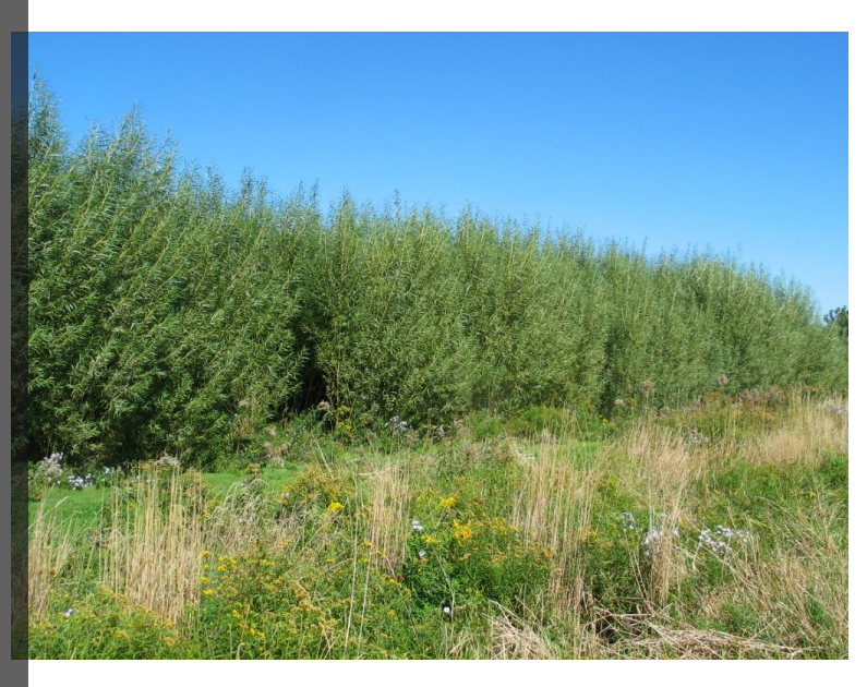
Wilmot Valley willow biomass AAFC trial